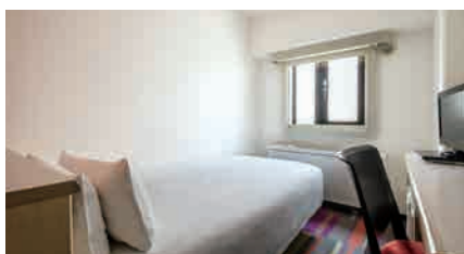
Single 10 – 11m 2 20 rooms (3 – 11F)

118 rooms Check-in: 15:00 Check-out: 11:00