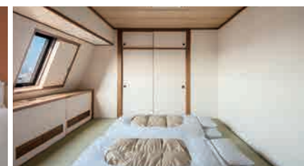
Japanese Room 23, 32m 2 2 rooms (12F)

Located 2 minutes on foot from Sangenjaya Station, the b sangenjaya is an urban hotel where you can relax comfortably while in the center of the city. A free coffee station offering freshly-brewed coffee is available in the lobby for you to enjoy, along with free WIFI throughout the hotel. Feel free to use our services each morning, or during your work breaks.